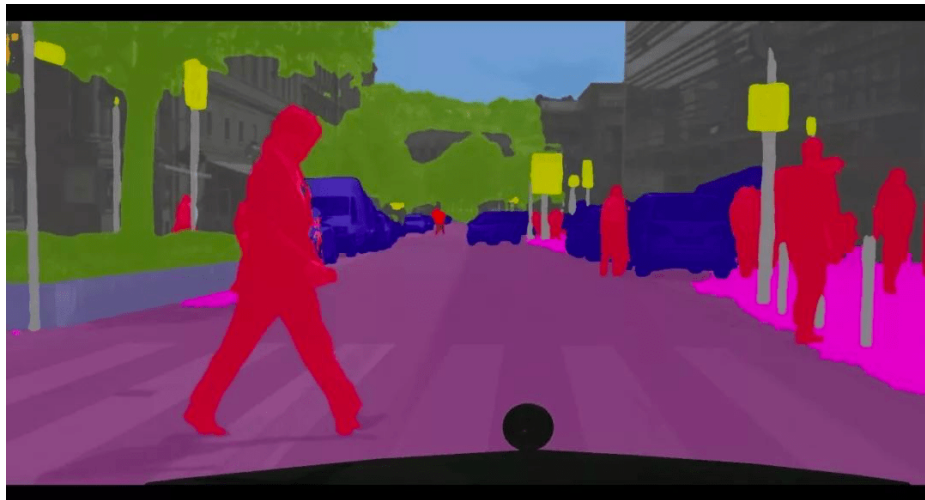
Figure 1: Schematic representation of the image segmentation problem. For every pixel of one input image, the system must produce one output (label) that corresponds to the type of object at that location.

Image segmentation involves converting an image into a collection of regions of pixels that are represented by a mask or a labeled image. By dividing an image into segments, we can process only the important segments of the image instead of processing the entire image.