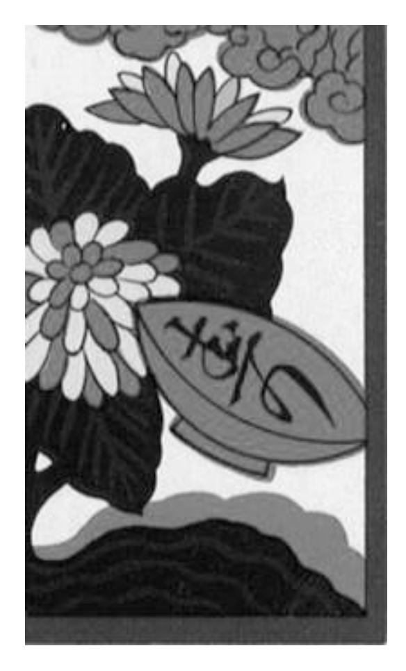
Figure 1.1. Hanafuda card.

Companies such as Sony followed a completely different approach. Created to focus on consumer electronics, the company known as Sony today was founded by Akio Morita and Masaru Ibuka as the Tokyo Telecommunications Engineering Corporation in 1946. The core business of the company was making tape recorders, which were miniaturized with the advent of solid-state transistors. As soon as the