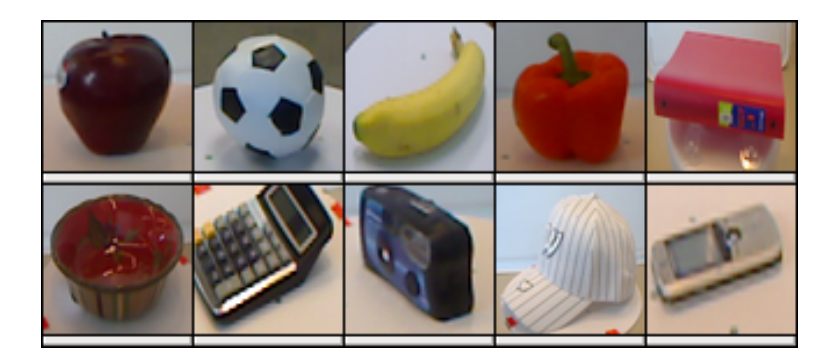
Fig. 1. One sample RGB image of each of the 10 object categories used in the experiments. Note that in each category, there are usually more than 3 or 4 different objects that can differ significantly between each other.