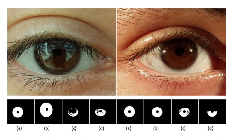
Fig. 3. Example of high resolution samples of the same subject, with good contrast and illumination in outdoor and indoor conditions, top left and top right respectively. On the leftmost sample, the high level of details produces a significant amount of fake iris features that introduce an unpredictable and unquantifiable bias in the performances of all the recognition methods. The bottom line shows the iris segmentations provided by the four methods considered in this study: (a) Barra et al. (b) Abate et al. (c) Haindl et al. (d) Yang et al.

sible to notice that the segmentation by Haindl et al. produces the most stable results when adopted by the recognition methods considered in this study. Although the corresponding verification scores are not the optimal ones, the result is interesting because it further confirms the stability/reliability of this segmentation method in comparison to the others (see Section 4.2). To this regard, let us observe that the iris mask in Fig. 3(c), left part, ignores a significant part of the region that is interested by occlusions due to environmental reflections, and, consequently, a lower amount of fake iris features is included. This justifies the stable behaviour of all four recognition methods when the segmentation by Haindl et al. is used. On the other hand, the removal of occlusions may also cause the removal of true iris patches, and therefore also reduces the amount of true iris features, thus possibly impacting on the level of verification performances. Notwithstanding this, Table 7 shows that the verification scores produced when the segmentation by Haindl et al. is used are, on average, the highest ones. This confirms that noise reduction always produces a recognition improvement by avoiding the introduction of ambiguous iris features.